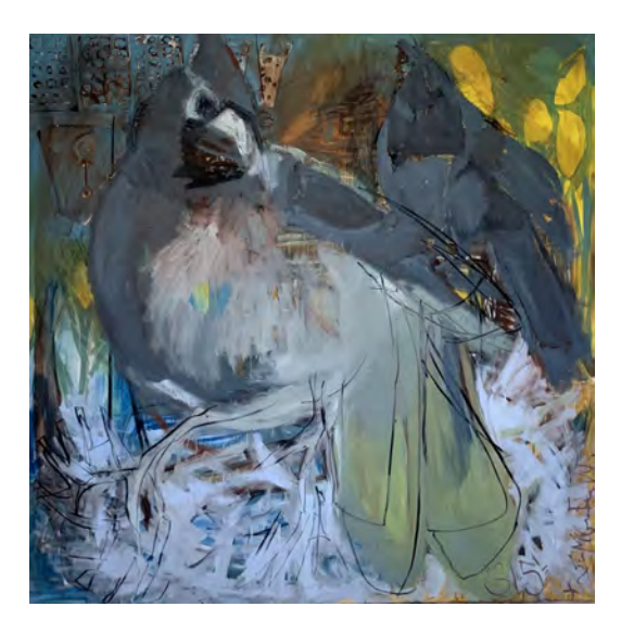
315True Home Beckons , symbolizes my return to the Louisville, Kentucky home of my childhood. With the cardinal as the State Bird, my time of wandering around the country following my husband's ministry career is almost over. Our family home was gifted to me in 2020, bringing great Joy. (72x72, oil)

Of the four 6 \times 6 feet paintings shown, three are based on my missionary grandmother's Sunday School printed educational materials she used in Nigeria 1940's- 1980's.